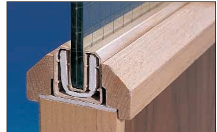
System-90 PLUS in door leaf using wired glass

System-90 PLUS can be supplied in a wide range of standard colours.