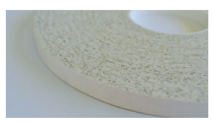
Available in 7.5m rolls ex stock

It is suitable for use in both timber and steel fire rated glazing systems.