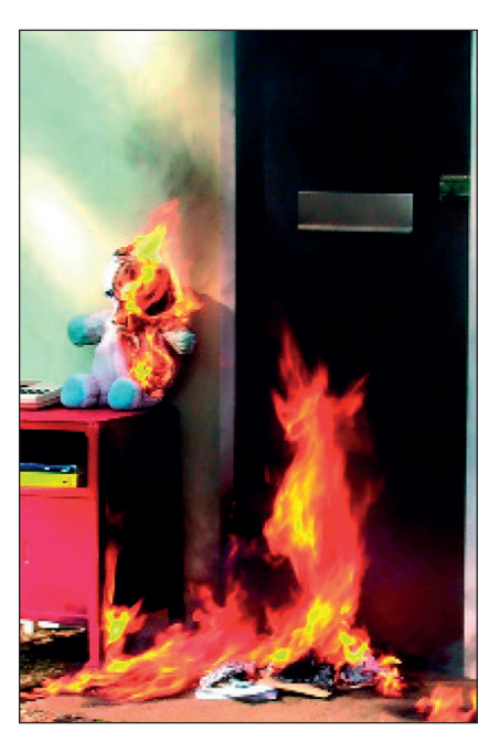
Unprotected letterbox fire

Use the flexible firebag (illustration 3) in situations where doors open tightly onto walls, allowing full door opening.